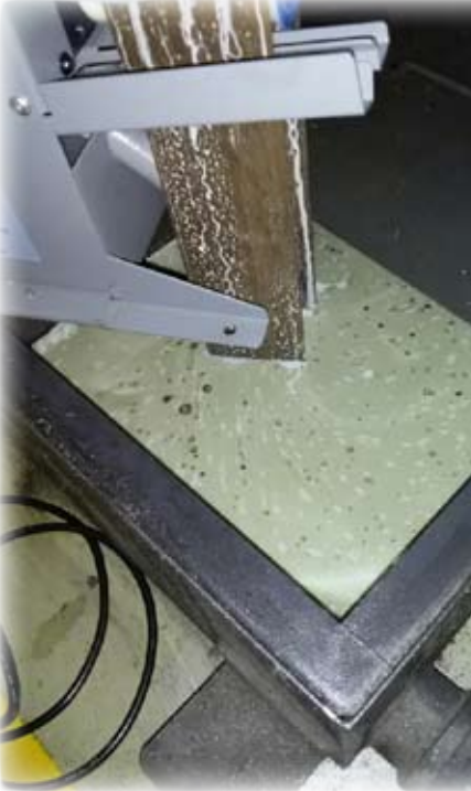
Test Photos - Start